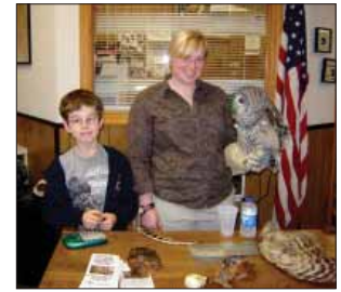
Young attendees enjoyed learning about the owl species and meeting live owls. The overview and meet-and-greet was provided by the Beaver Meadow Audubon Center.