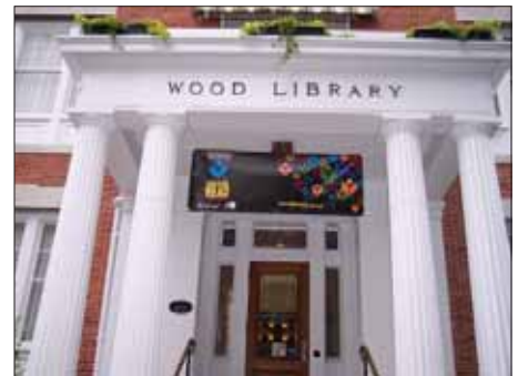
Wood Library participates in the Big Read

Children experienced Poe through events such as "Something Spooky," storytime and crafts, "Horrorgami" paperfolding with a twist and at "The Mask of Amontillado" where masquerade masks were created.