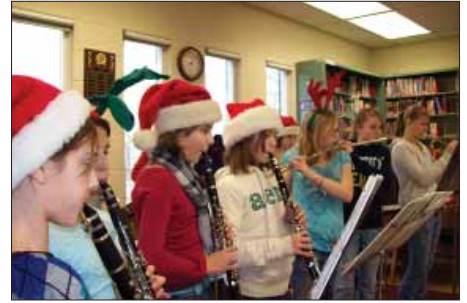
Attica Central Middle School Band provides the sounds of the season for Attica's first Winterfest held at the library.

Thank you to all of the elves, musicians, and visitors for starting the holidays with a joyful time at the library.