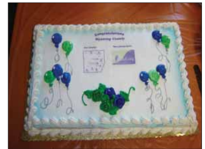
Celebration attendees were provided with numerous treats including cake, cookies and refreshments. Raffle baskets were provided by each library and the drawings were a crowd favorite.

***Mark Your Calendar—Upcoming Trustee Workshop***