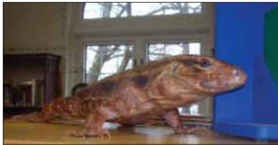
A recent program at the Livonia Public Library provided a chance to meet up close a Skink Lizard.

The Livonia Public Library partnered with the Wildlife Educators Coalition for a five week series. Taking place on consecutive Saturday mornings at the library, the WEC brought in a wide range of exotic and regional animals. The series, based on the senses